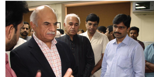
Chairman, P&D Board being brief about Knowledge Management Centre at P&DD

The only thing that you absolutely have to know is the location of the library.”