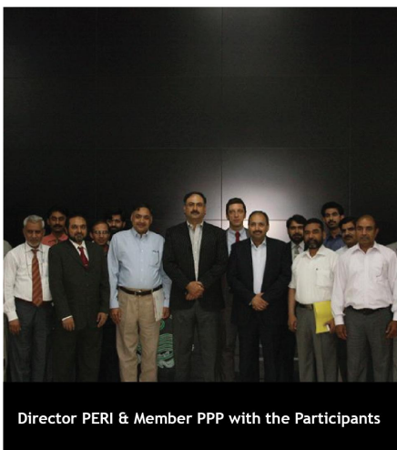
Director PERI & Member PPP with the Participants

Punjab Economic Research Institute (PERI) of Planning & Development Department in collaboration with Italian Government & Pakistan Agriculture Research Council (PARC) launched a report titled "Market Analysis for Value Chain & Olive Oil Consumption in Pakistan", considering Olive sector has a vast potential in Pakistan. Punjab government has also recently launched an Olive Development Project in Potohar region in Punjab. Pakistan has numerous potential for extraction and cultivation of Olive Oil and the Punjab Government has the support of private and corporate sector to promote olive oil extraction. This study will also greatly help the Agriculture sector for olive oil development. According to PERI, local olive has immense potential if private and public sector cooperate in processing and extraction.