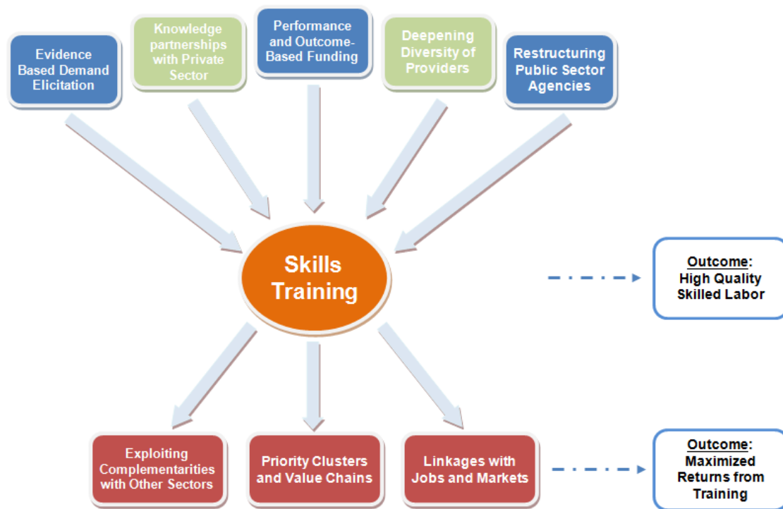
Summary Figure 2. A New Model for Skills Training in Punjab